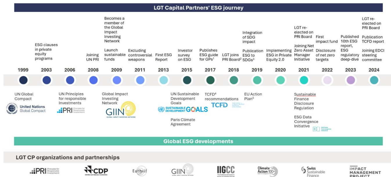
Figure 1: LGT CP's continuous development of ESG processes spanning two decades

This document explains LGT CP's overall approach to integrating ESG criteria into the investment process, as well as the governance setup and other related topics.