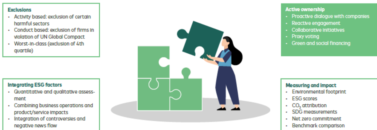
Figure 3: Holistic approach: active ownership – one pillar of our ESG activities